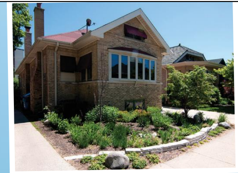
Plants and Grass love rain barrel water.

Rain barrels are just one type of green infrastructure that can capture water to help prevent flooding and improve water quality. Green infrastructure mimics the natural environment by holding stormwater where it falls. Other types of green infrastructure homeowners can incorporate into their property include rain gardens, permeable pavement, cisterns, native landscaping, stormwater trees and green roofs. Municipalities throughout Cook County are also going green, utilizing greenways, wetlands, green alleys, streets and parking lots to help capture water.