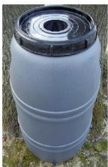
STYLE 1 RE-PURPOSED

This is a re-purposed barrel from the food industry, used to transport items such as pickles or olives. As a re-purposed product the body will have slight imperfections like scuffs or marks.