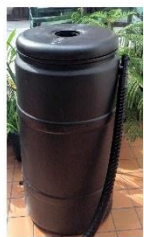
STYLE 2 RECYCLED PLASTIC

This barrel is manufactured from recycled plastics such as used bottles.